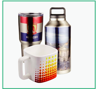
Can be applied for products of more different sizes and shapes.